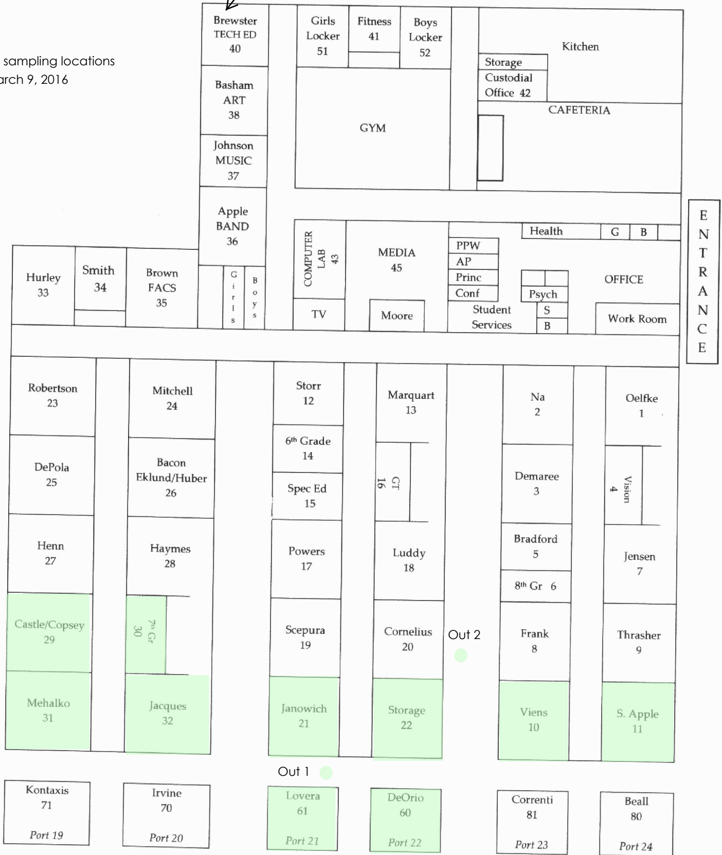
Glenwood Middle School Floor Plan

Spore sampling locations for March 9, 2016